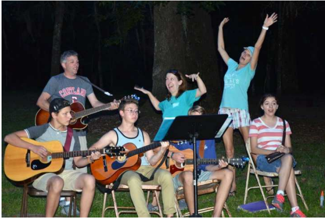
Saturday night Sing-Along