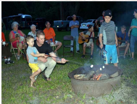
MMM- Toasted Marshmallows