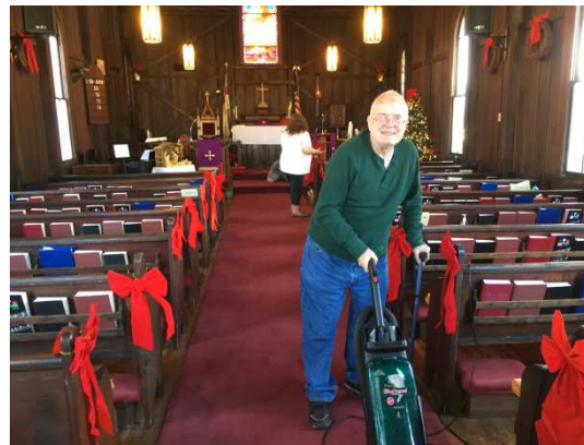
Cleaning and Greening the Church