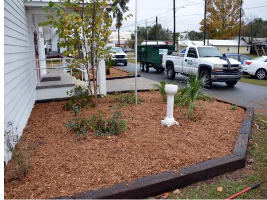
Finishing the playground and garden with mulch.

Those who participated in our Float in the High Springs Christmas Parade