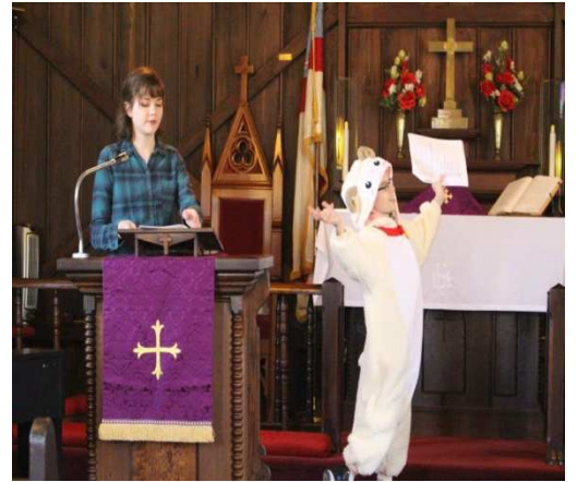
Christmas Pageant "Journey to Bethlehem"